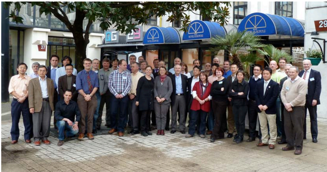
Figure 1: Participants to the DS 3 F and IODP EDP joint session