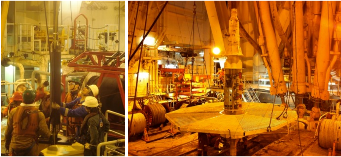
Figure 5: CORK deployment on the Chikyu