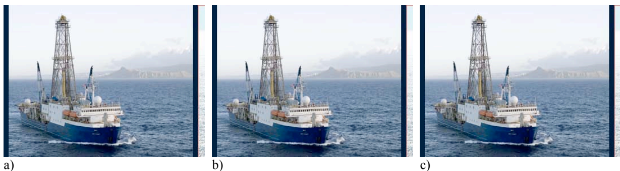
Figure 2: Three types of drilling platforms in IODP: a) Non-riser drilling with DV JOIDES Resolution , b) Riser drilling with DV Chikyu , c) mission-specific drilling (here: Example of Arctic drilling).

There are still long standing issues, however. Drilling does not allow the recovery of the first decimeters or even several meters beneath the seabed and, therefore, does not provide samples for the water/seafloor interface. Good recovery in some formations, such as young fragmented basalts, sands, mixed lithologies, fault zones, etc., is still problematic. Starting holes in bare rocks remains a challenge. The current DV Chikyu riser system has a water depth limitation of 2500m, leaving a large percentage of the ocean basins out of reach for deep drilling. Work is progressing to expanding the water depth capacity to 4000 m water depth.