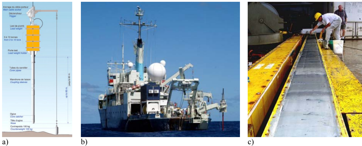
Figure 4: Piston coring using a) Calypso corer, b) WHOI long core , c) CASQ (CALypso SQUARE) corer.

Piston coring is traditionally used from all research vessels around the world to collect sediments from the seafloor. A number of systems have been developed worldwide, all derived from the Kullenberg corer that can be operated theoretically at all water depths with various maximum sampling depths. The Calypso corer developed by IPEV (Institut Paul Emile Victor, Brest) and operated from the research vessel RV Marion Dufresne has the sampling depth record of 75m (Figure 4a). In comparison, the WHOI Long Core (Woods-Hole Oceanographic Institution) can collect cores up to 50 m in length (Figure 4b); the STACOR© corer, developed by IFP (French Institute of Petroleum) and Fugro, reaches depths of 35 m; and ~20 m of penetration has been obtained by the hydrostatic corer Selcore that was developed jointly in Norway by Selantic AS and the University of Bergen. Selcore is designed as a gravity piston corer, but it also has potential as a seabed seismic hammer source ( http://www.geo.uib.no/hjemmesider/yngve/docs/hydrostatic_corer.pdf ).